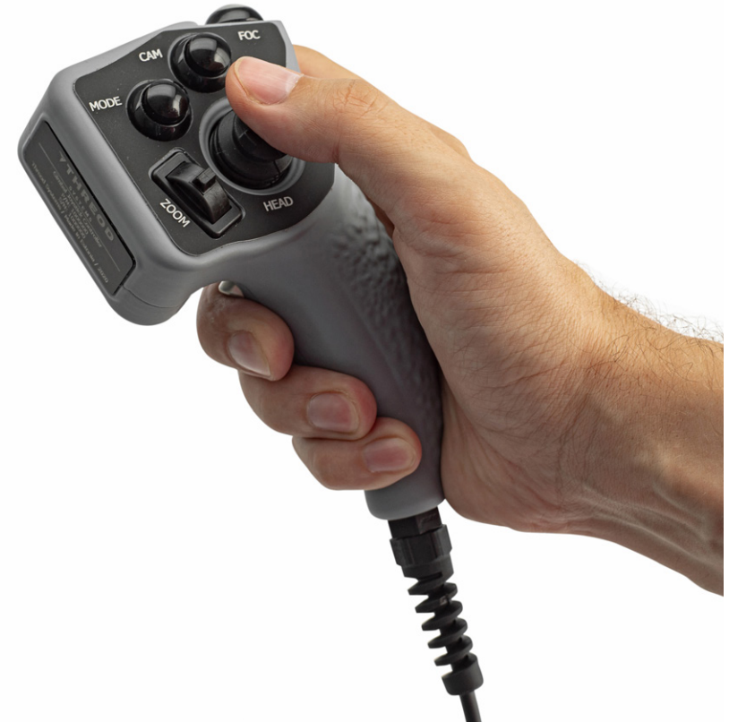
The ergonomics of HC3